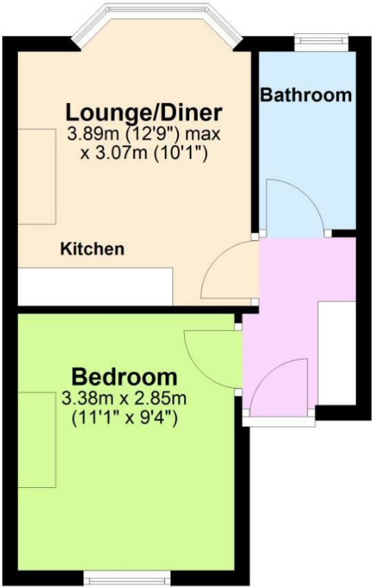
Floor Plan Approx. 27.2 sq. metres (292.4 sq. feet)

Total area: approx. 27.2 sq. metres (292.4 sq. feet)